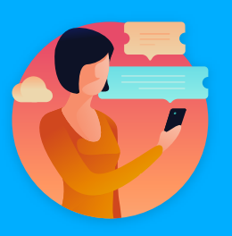
Push Coupons Send Coupons via an Ultrasonic Notification