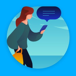
After Light Show Send to a lucky winner or all participants